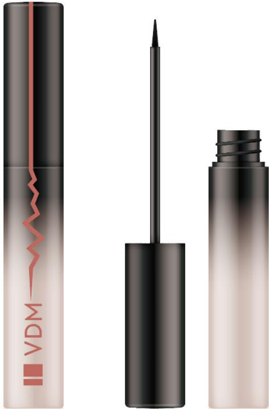
MATERIAL:PETG NET WEIGHT:9.3ml SIZE : 16x108.7mm