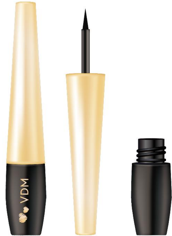
MATERIAL : PETG NET WEIGHT : 6.2ml SIZE : 18.3x104.2mm